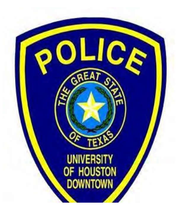
Lieutenant Trinity Delafance